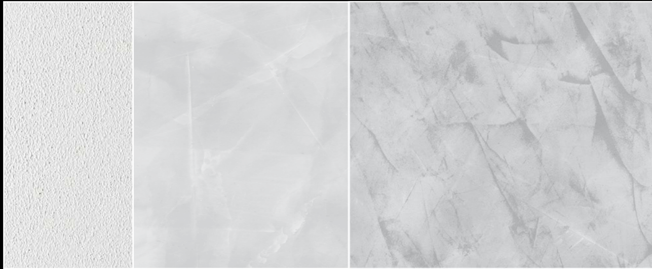
rialto zip application of one coat by roller