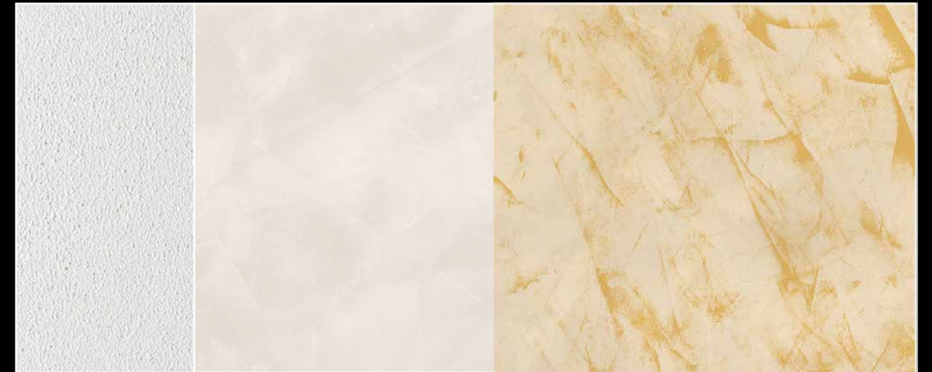
rialto zip application of one coat by roller