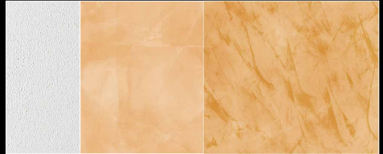
rialto zip application of one coat by roller