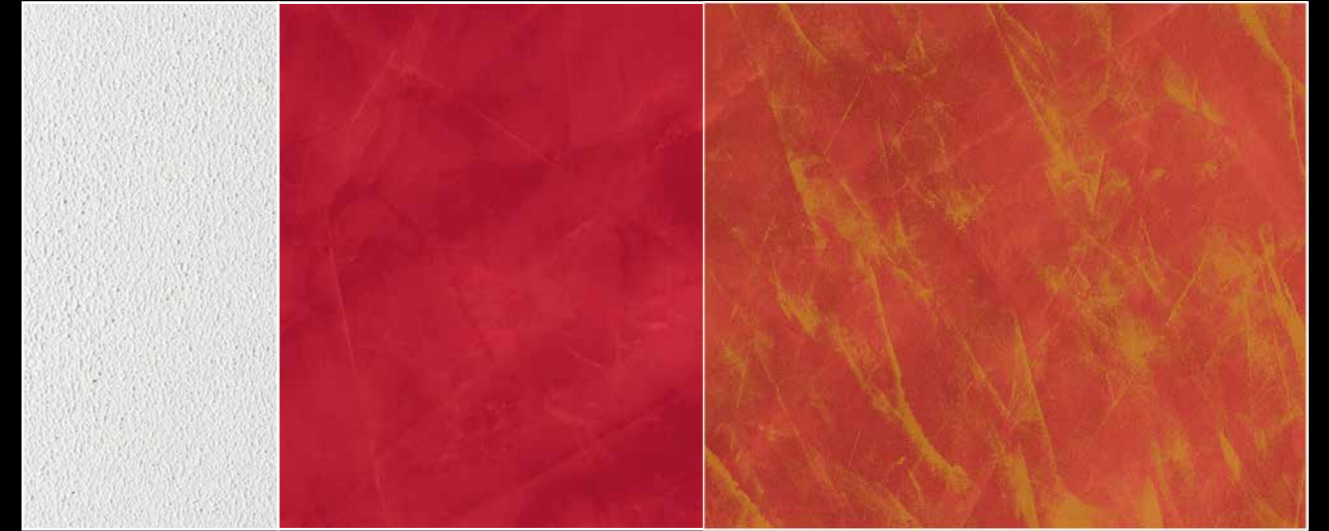
rialto zip application of one coat by roller