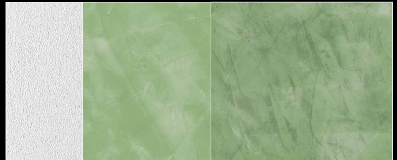
rialto zip application of one coat by roller