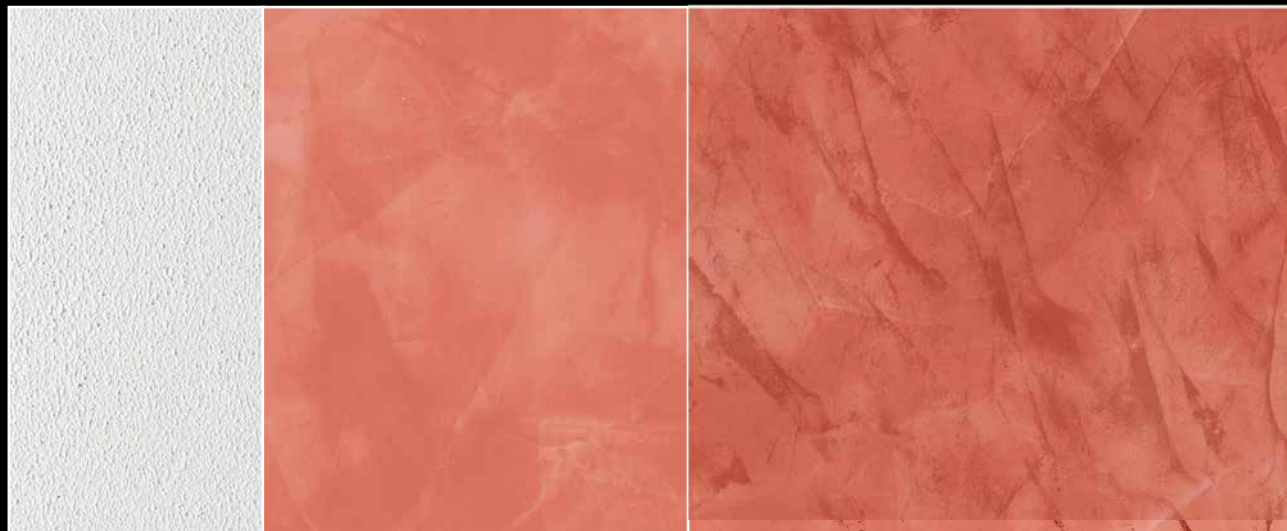
rialto zip application of one coat by roller