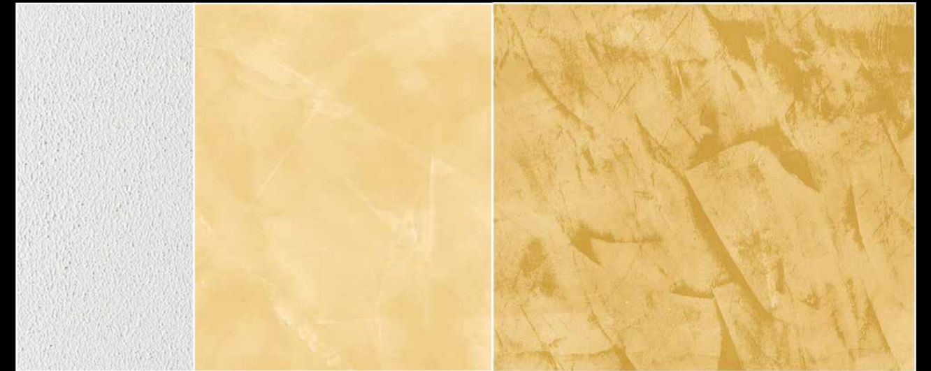
rialto zip application of one coat by roller