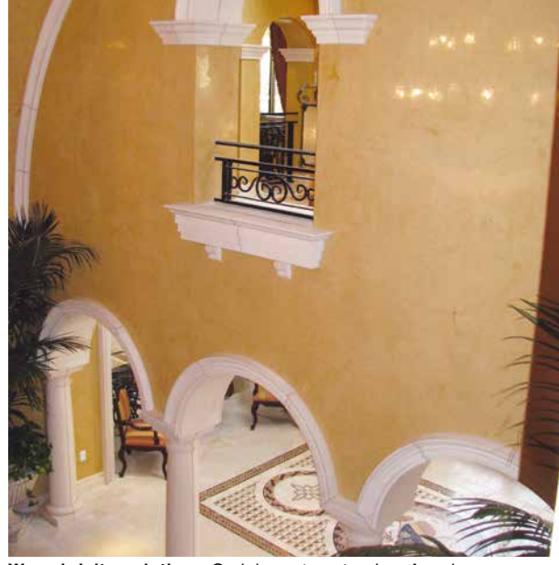
Waxed rialto solution - Orsini apartments - Los Angeles California - USA