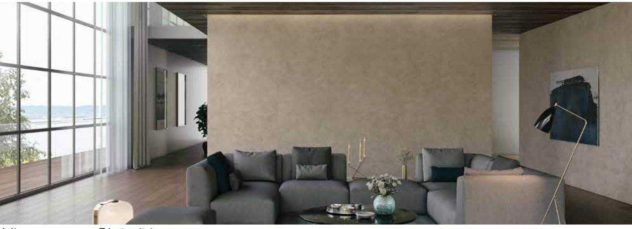
rialto epoca marmo - Trieste - Italy