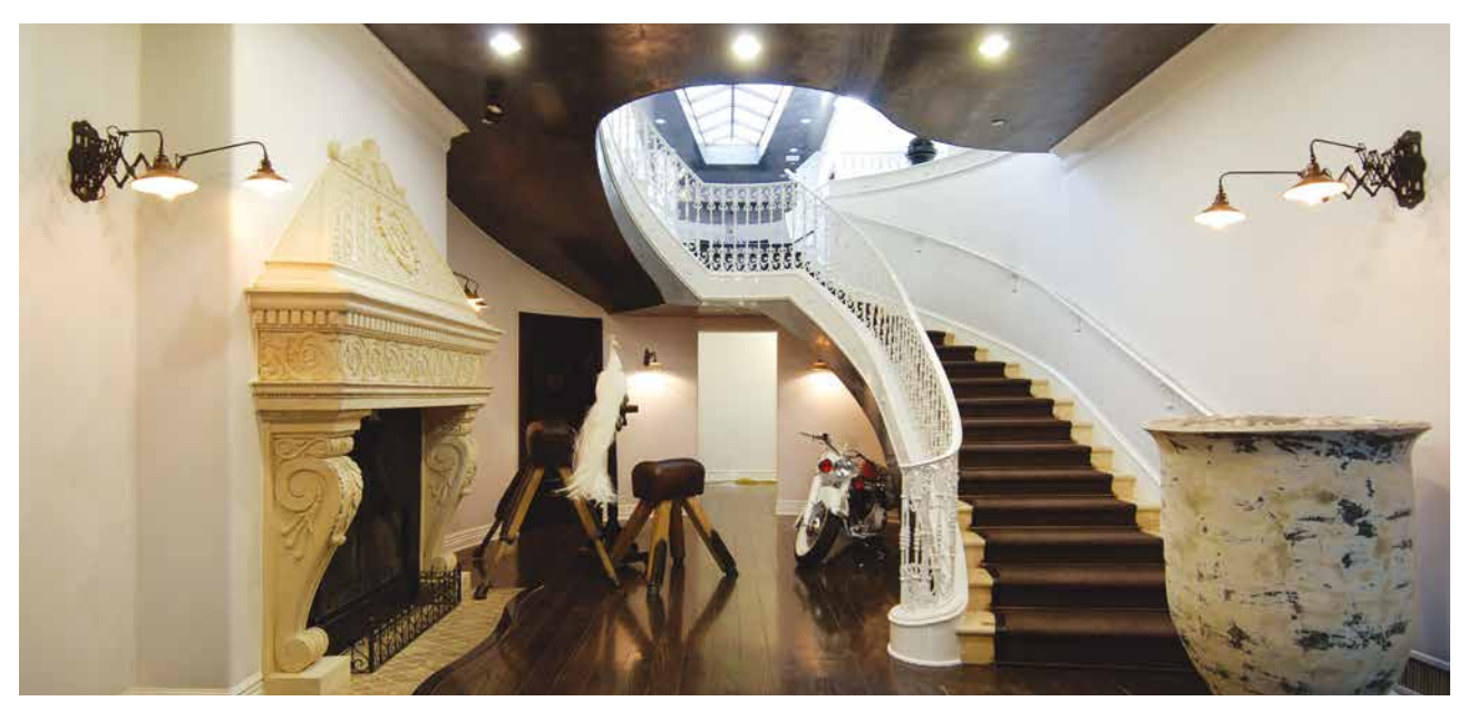
rialto evolution - Los Angeles - California - USA