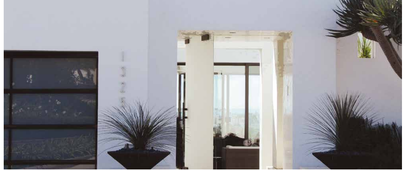
rialto solution - Newport Beach - California - USA