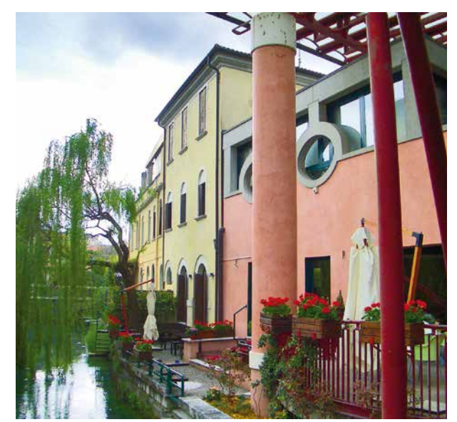
rialto epoca spatolato - Sacile - Italy

For technical details and specifications download them from our website at www.rialto-colors.com or contact your local dealer.