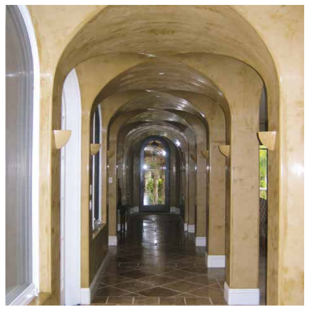
rialto evolution - Villa park - California - USA