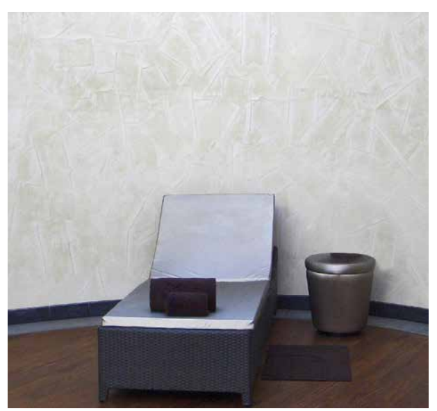
rialto evolution - Algarve - Portugal

rialto venetian plasters are for professional use only. Training courses are available for professional contractors. Ask your dealer or contact us directly in Trieste, Italy at: rialto@rialto-colors.com telephone +39 040 3186611