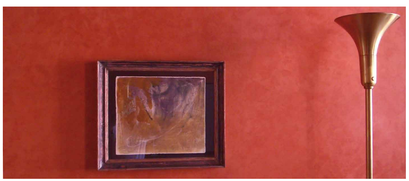
rialto veneziano - Trieste - Italy